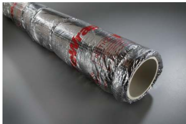
FyreWrap 0.5 Plenum Insulation