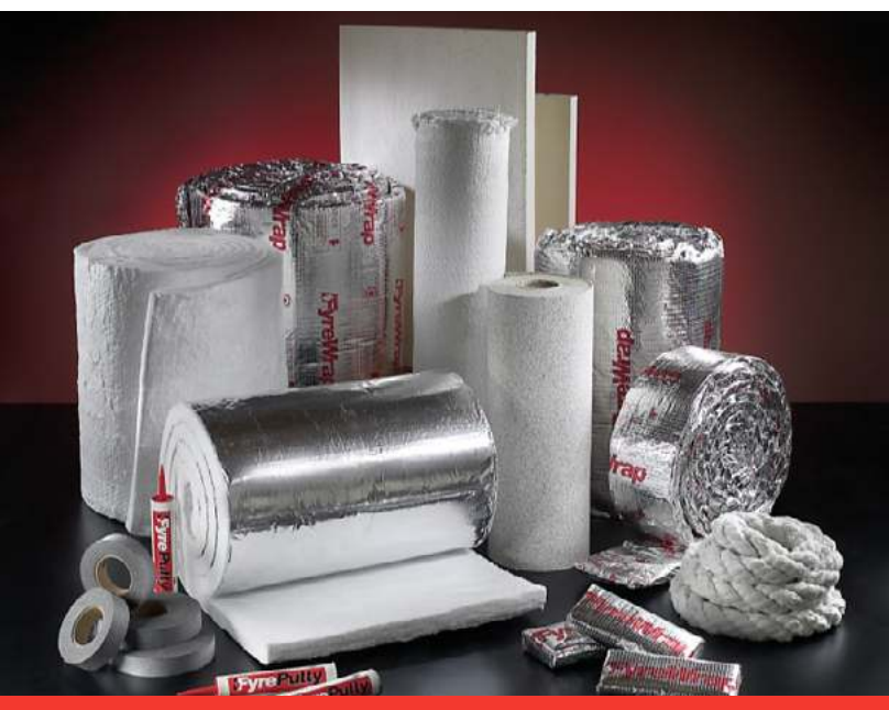
Insulation available in a selection of roll sizes

Alkegen manufactures a wide range of high temperature insulating materials especially suited for use in marine and offshore passive fire protection installations. These products and their variants are parts of our FyreWrap® brand. For more than 30 years, FyreWrap materials have provided lightweight fire insulation for structures exposed to both cellulosic and hydrocarbon fires in cruise ships, yachts, high-speed ferries, military defence vessels and offshore platforms.