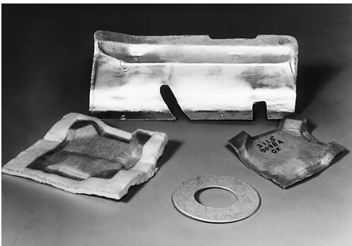
Press-formed parts made from Fiberfrax Duraset felt.

For additional information about product performance or to identify the recommended product for your application, please contact the Alkegen Application Engineering Group at 716-278-3888.