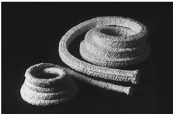
Fiberfrax Round and Square Braid