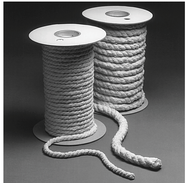
Fiberfrax Rope and HD Rope