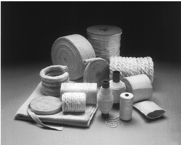
Fiberfrax Woven Textiles Product Family

For additional details on the available woven textile product forms, typical properties and applications for which they are appropriate, refer to Fiberfrax Woven Textiles, Product Information Sheet, Form A-5293.